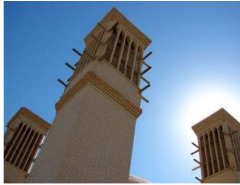
Fig. 9. Hot-dry regions house windows.

The commonly used materials for building large walls in hot and dry areas include mud slurry, mud brick, stone head, brick, ash slurry, stone ash, and wood (Figure 10).