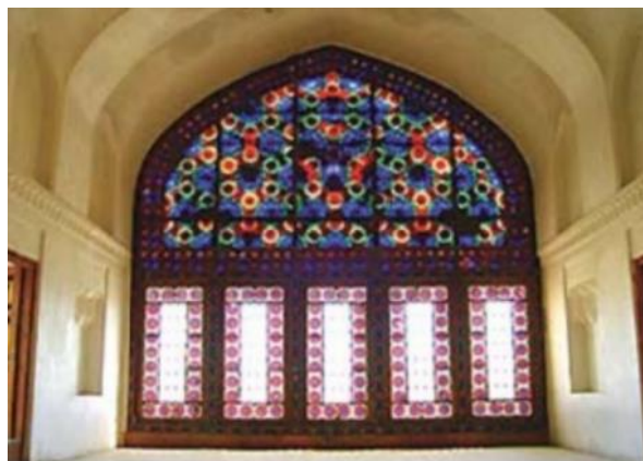
Fig. 8. Hot-dry regions house windows.

Windows are usually small in hot and dry areas and are located at the top of the wall near the sky panel. There are not so many Windows on the outer wall, but there are many Windows in the courtyard facing the inner wall. These Windows will promote ventilation. The wind catcher also helps ventilate the interior of the building (Figure 8).