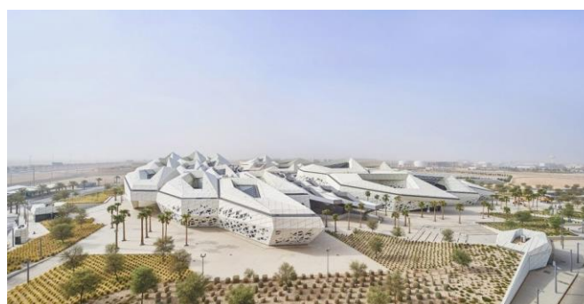
Fig. 11. KAPSARC campus five key buildings.

The design responds to the environmental conditions of the Riyadh Plateau, minimizes energy and resource consumption, and was recently awarded LEED Platinum certification by the US Green Building Council. The basic layout of the building is based on a cellular, semi-modular system in which the different buildings form a whole, connected to each other through public Spaces (Reference Figure 11). Hexagonal prisms shaped like honeybees form a cellular lattice system in a limited volume with a minimum of materials. This structure and organization principle defines the essence of KAPSARC: a crystalline structure emerging from the desert landscape that optimally responds to the environmental conditions and at the same time meets the functional requirements of the internal space. The honeycomb lattice gradually flattens towards the central axis, echoing the natural environment of the river bed extending to the west [8].