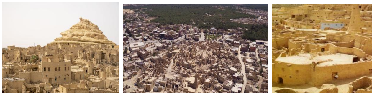
Fig. 1. Shali castle in the west desert in Siwa, Egypt.

The residents of Siwa Oasis develop their eco-tourism industry with restraint and rationality, and everything is based on the protection of the forest resources. There is no massive felling of trees to build modern houses to attract tourists, and over the past thousands of years, the forests, the oasis, and the human beings have protected each other in this way and coexisted harmoniously. The Architecture of the Siwa Oasis in Egypt can be seen in Figure 1.