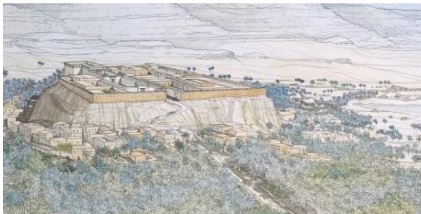
Fig. 2. Castle restoration imagery.

Aristocratic architectural features. The orientation of aristocratic buildings was purposely designed especially for the privileged, so the entrances and exits as well as the windows of most of the buildings face different directions, which are closely related to the stars and the sun in the sky (Reference Figure 2).