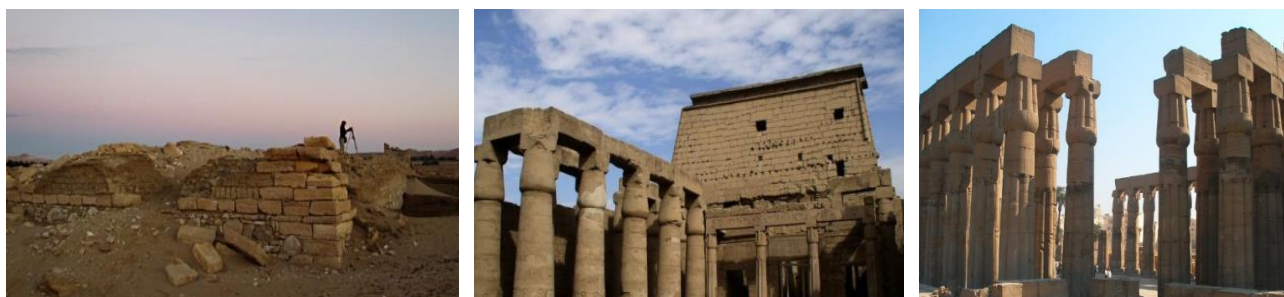
Fig. 3. The Temple of Amun.

Features of religious architecture. Mostly stone masonry. Divided into an inner courtyard with a colonnade, a hall of columns, and a shrine. In front of the main entrance, there is an obelisk or a statue of Pharaoh. The front wall is carved with colorful light reliefs. The diameter of the columns in the Hall of the Great Columns is larger than the spacing between the columns, which enhances the atmosphere of the temple. Examples of architecture include the Temple of Amun (Reference Figure 3). The works of Egyptian artists had a practical purpose. They were not only an expression of inspiration and captured the imagination, but also conveyed the correct religious laws and connected the relationship between man and God [3].