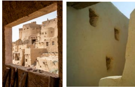
Fig. 4. Windows in traditional buildings.

The Siwa Oasis building is characterized by Karshif which is a special material Karshif material is used. This is an unusual material. It consists of sodium chloride salt crystals with impurities of clay and sand. These irregularly shaped lumps, taken from the salt crusts around the salt lakes were cut into smaller pieces and then masoned with mud. The mud is rich in salt extracted from two different types of clay - tafla or tiin. To improve the joints between the walls, wooden planks were also laid inside the walls. To improve the connection between the outside and the inside especially where the walls are wider [4]. The courtyard is a time-tested and valuable design pattern, located inside the house to protect against extreme heat and cold, as well as wind, sandstorms, and more. Inside, there are completely different room configurations, and the locals use different rooms depending on the season, using rooms with roofs in the winter and rooms without roofs in the summer, in lieu of mechanical refrigeration (Reference Figure 5).