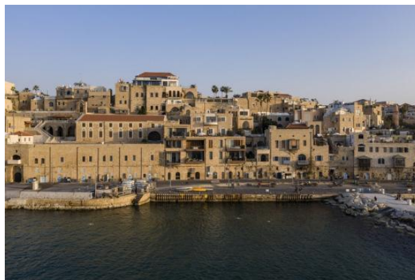
Fig. 14. Urban environment.

Facing the endless waves of the sea that break right at the entrance to the Old City, townhouses, adorned with impressive and traditional stone cladding, stand tall (Reference Figure 14). Within one of these historic buildings lies an apartment that has been transformed into a meticulously designed, one-of-a-kind house by architects Raz Melamed and Omar Danan [9].