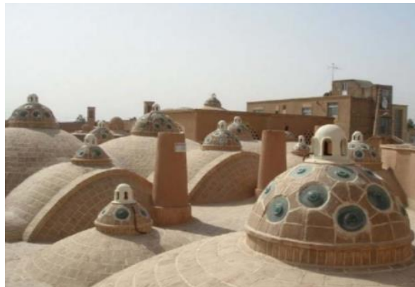
Fig. 7. The dome's roof.

Dome roofs are used to cover the roofs of mosques, reservoirs, and bazaars (shopping centers) and are another roof type for hot, dry areas. Apart from structural reasons, there are some thermo-physical reasons for dome roofs built in this region [6]. Due to the uneven surfaces of the domed and gabled roofs, the sunlight strikes the roof at different angles. As a result, part of the roof is always in the shade in the morning and afternoon. This effect on the intensity and angle of solar radiation helps to cool the roof (Figure 7).