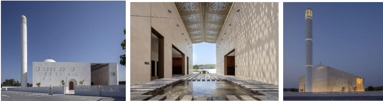
Fig. 13. External view of the building.

Dabbagh Architects endeavoured to eliminate the use of numerous volumes and simplify the conventional Islamic architectural style by reducing complexity to reveal its core. As part of the design refining process, the primary building volume was divided into two sections - the prayer block, housing separate spaces for men and women, and the service block, comprising ablution amenities and areas for the Imam, who leads the prayers, and the Moazen, who summons the prayers.