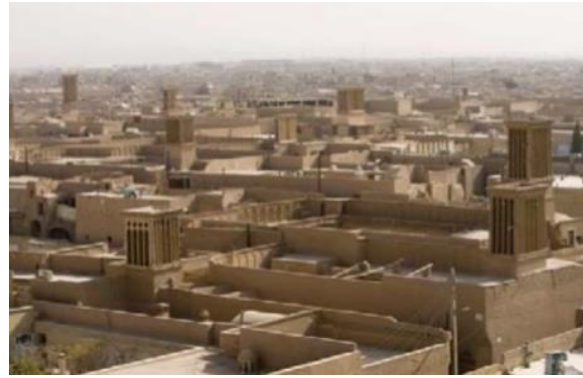
Fig. 6. Yazd urban texture.

Dome roofs are used to cover the roofs of mosques, reservoirs, and bazaars (shopping centers) and are another roof type for hot, dry areas. Apart from structural reasons, there are some thermo-physical reasons for dome roofs built in this region [6]. Due to the uneven surfaces of the domed and gabled roofs, the sunlight strikes the roof at different angles. As a result, part of the roof is always in the shade in the morning and afternoon. This effect on the intensity and angle of solar radiation helps to cool the roof (Figure 7).