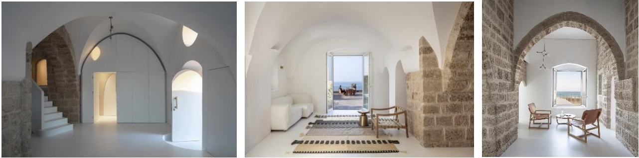
Fig. 15. Detailed view.