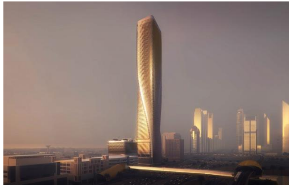
Fig. 16. Detailed view.

Dubai is undergoing an urban transformation and hopes to transform it into a livable city for all seasons through a series of urban construction projects. As arrive in the city by plane or car at night can feel this behemoth of a city evolving, connecting the city, its inhabitants, and the culture of the region. The 300-meter-high Wasl Tower is designed to do just that (Reference Figure 16). A vertically twisting tower, it rotates in all directions of the city, and a series of public spaces are integrated into it.