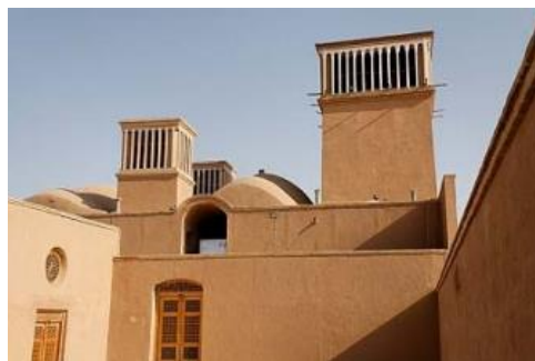
Fig. 10. Material in desert architecture.

The commonly used materials for building large walls in hot and dry areas include mud slurry, mud brick, stone head, brick, ash slurry, stone ash, and wood (Figure 10).