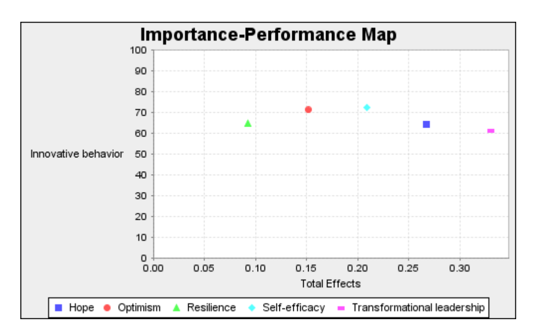
Figure 2. Constructs unstandardized importance-performance effects on employees' innovative work behaviors.