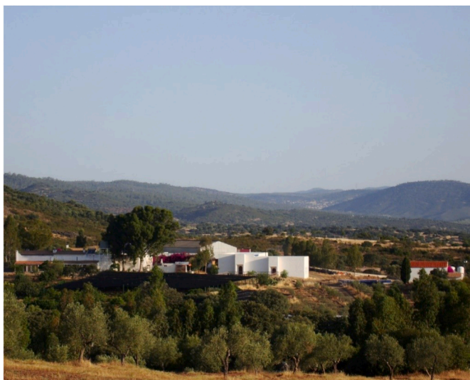
Fig. 2. Los Portales Community.