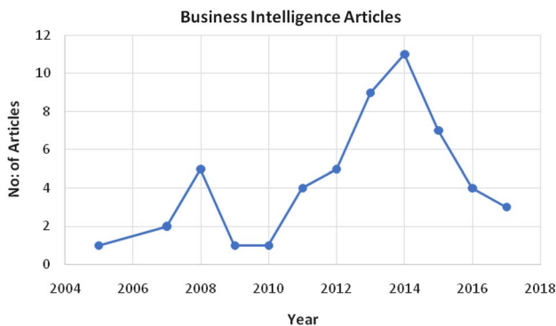
Fig. 1 Publications trend of papers on BI at world level.

Performance and CRM. Articles were found on individual basis of these three factors whereas no article was found dealing all the three factors in common. Consequently, the present study identified the scope of measuring the relationship between Business Intelligence Adoption and Bank Performance with the moderating effect of CRM.