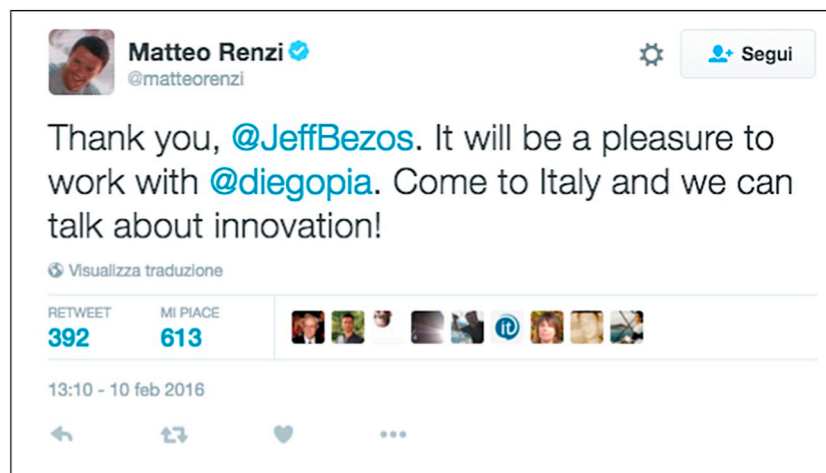
Fig. 4. Tweet by Matteo Renzi, February 10, 2016, in response to Jeff Bezos, Amazon.com.