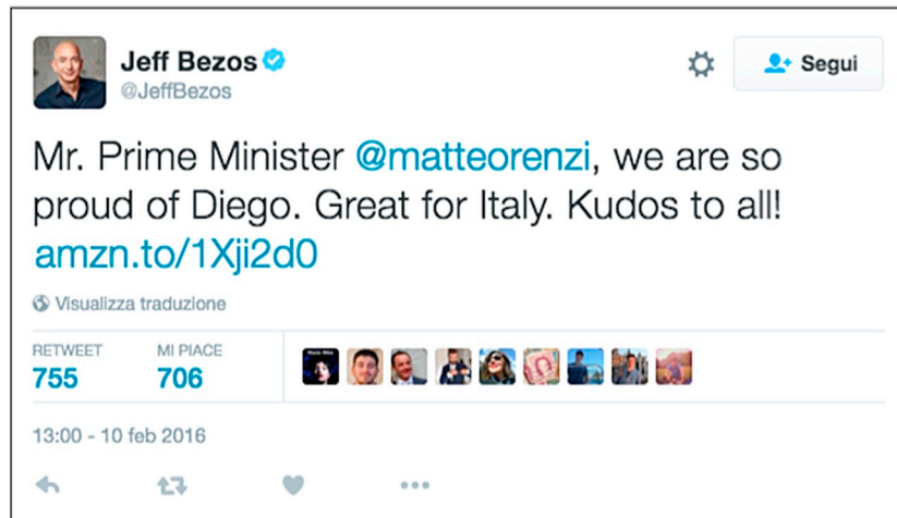
Fig. 3. Tweet by Amazon.com CEO Jeff Bezos, February 10, 2016, congratulating Italy's Prime Minister Matteo Renzi for hiring Diego Piantentini from Amazon as Commissioner to build the Team Digitale, Italy.