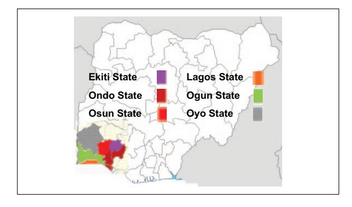
Figure 2. Map of Nigeria showing south-western region.

Association of Nigeria, the researcher established initial contact with 20 companies located in the South-Western region of Nigeria via emails and phone calls. This phase of the study was quite challenging as initially the companies were not willing to communicate with an "unknown person" via the phone and/or email. In fact, no response was received until a copy of the research introductory pack was sent to each company. Table 2 gives the subsequent sequence of events for the study's interviews.