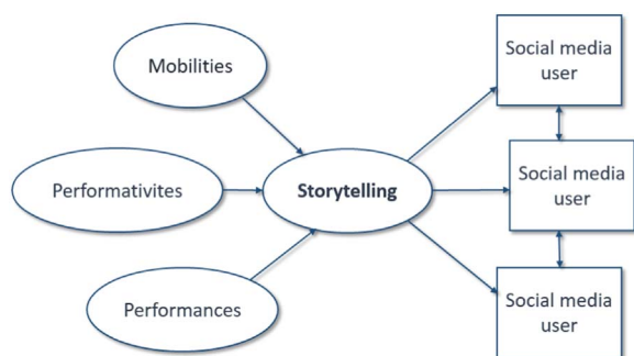
Fig. 1. Technologies of power in social media. The storytelling of a user influences other users.

Brands are used in this context as a resource to construct and express identities: brands are changed and customised in order to fit user's individual identity projects (Gensler et al., 2013; Smith et al., 2012). Furthermore, as social roles are dynamic concepts, they are continually reshaped through the process of social interactions and communication within socialities (Peters et al., 2013), and brand narratives may therefore be changed in line with changing roles. Brands are thus absorbed into individuals' self-representations, where they are modified and personalised to construct desired social roles and