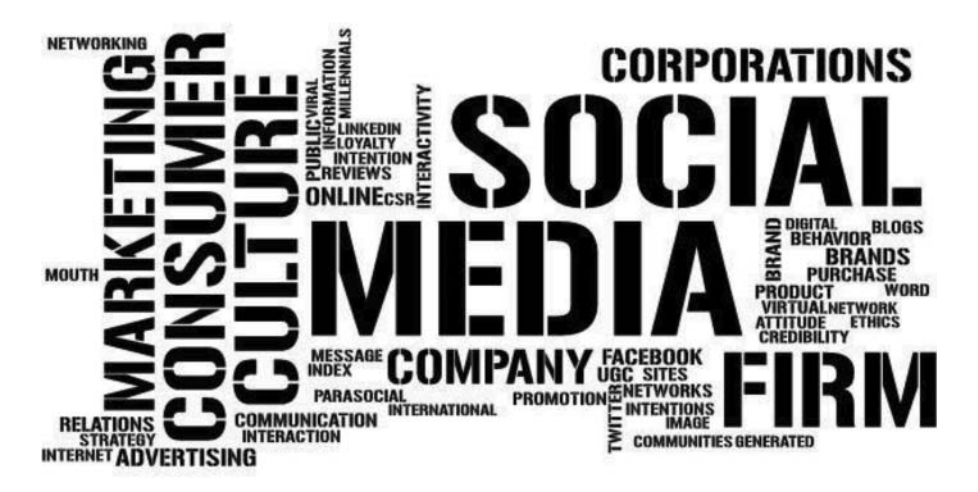
Figure 1. A representation of most used words in the articles analyzed from the Journal of Promotion Management (10 year period – 2007 until 2017).

ten years of social media marketing research – published in JPM from 2007 (until present) highlighting the numbers of articles with relevant keywords, whereby 'social media marketing' as a 'domain' or 'research focus' or 'research theme' was highlighted. Since social media marketing is an emerging area of research with research happening in all directions and dimensions, we didn't find any consistent variables under study for social media marketing research in JPM articles. Table 1 highlights number of relevant social media marketing articles published in JPM in a decade along with keywords / concepts / variables used in these studies and the study types (i.e., qualitative / quantitative methods utilized).