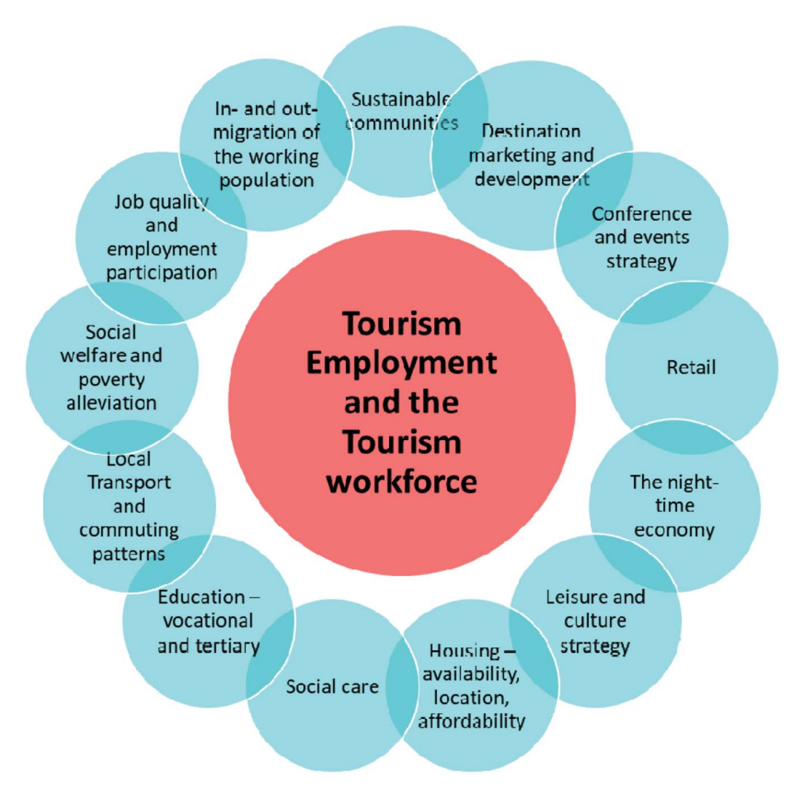
Figure 1. Indicative relationships between the tourism employment and the tourism workforce and the wider policy environment at the level of a destination/country.

cultural environment. Conceptualised by the author from an extensive review of labour market, destination and tourism literature, these relationships are not intended to be exhaustive and their relative significance will vary greatly from destination to destination. Andriotis and Vaughan (2004), for example, highlight what they call pluriactivity in tourism employment in their case study environment of Crete across a number of sectors but particularly in relation to agriculture where seasonal demand for labour complements that within tourism, highlighting the need to co-ordinate policy between these sectors within the labour market.