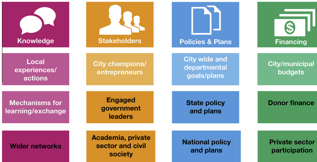
Fig. 2. 12 building blocks of sustaining urban climate change resilience.