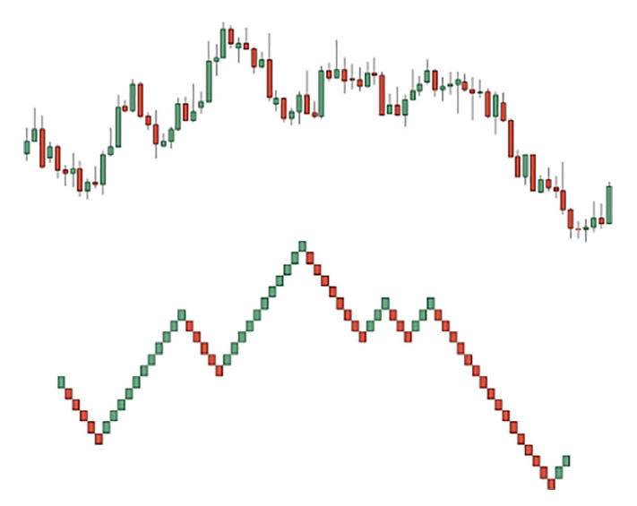
Fig. 1. The transformation of normal candlestick chart into a renko chart with 10 pips bricks based on closed price.

According to the Renko bars trading tool the common candlestick chart is transformed into a chart where the bars are formed based on the range that the security covers, independent of the time. Renko charts use price "bricks" that represent a fixed price move. As it is seen in Fig. 1, the new chart is formed up or down in 45° lines with one brick per vertical column. For example, in a