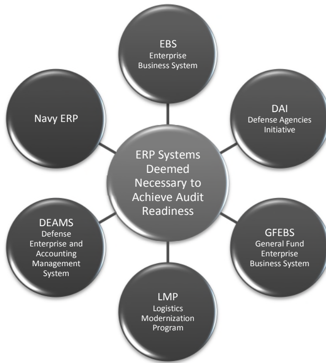
Figure 3. DoD ERP Systems