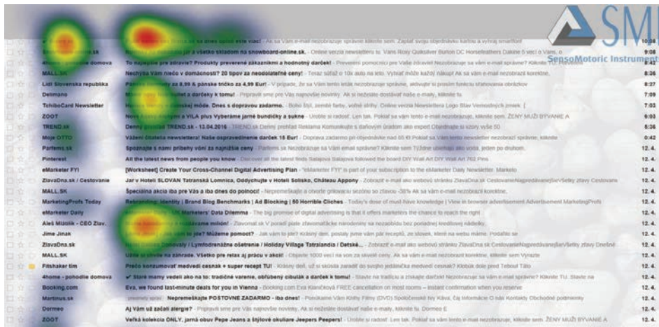
Fig. 2. User testing of e-mail subject with eyetracking technology [4]

(Area of Interest) functions. The KPI function split e-mails into sectors with the listing of the average time, the respondents spent on them [8]. The AOI function allowed splitting the email to basic architectural elements (header, head, introduction, top offer, body of the e-mail, end, foot, footer).