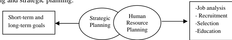
Fig 1. The link between strategic planning and human resource planning

mission, vision, values, environmental scan, goals, strategies, responsibilities, time lines, budgets, etc. In other words, if an organization operates in a stable market for many years, then planning might be carried out once a year and only in certain parts. The human resource planning is a process for assessing the demand and evaluating the size and the nature of supplies which will be required to meet the demand and therefore in the first stage of every staff and human resource management programs human resource planning is used. Human resource planning is directly linked with strategic planning and institutional policies. It is the main tool which aims to connect the organizational goals to the programs and goals of human resource. Figure 1 shows that there is a close relationship between human resource planning and strategic planning.