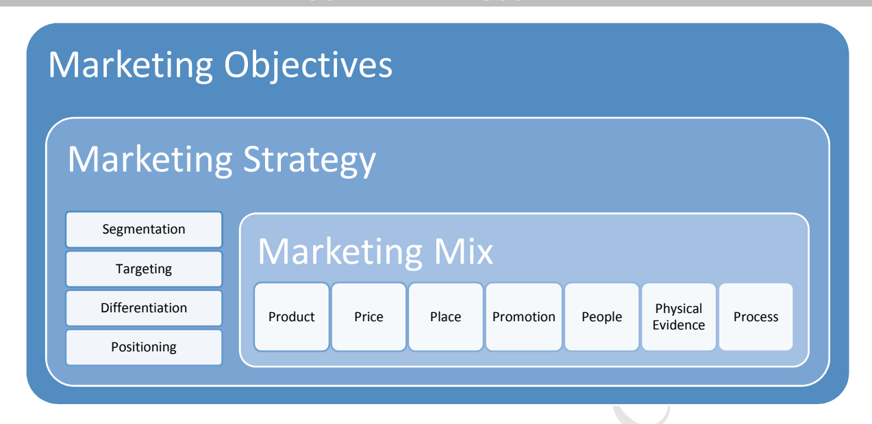
FIGURE 1: THE RELATIONSHIP OF MARKETING MIX (7P MODEL) AND MARKETING STRATEGY TO ACHIEVING MARKETING OBJECTIVES ADAPTED FROM LEVENS, 2 AND KOTLER AND COLLEAGUES. 1